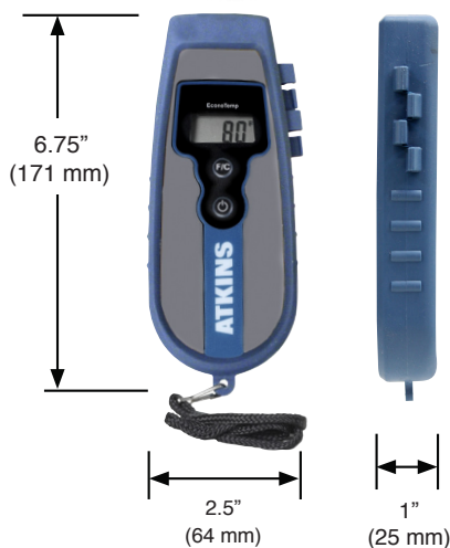
32311-K Thermocouple Instrument