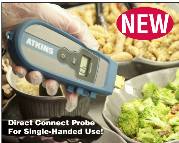
50337-K Direct Connect DuraNeedle Probe