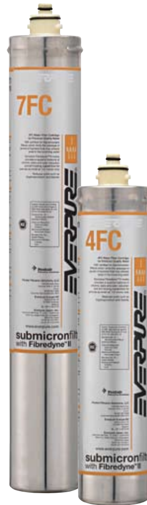
4FC Replacement Cartridge 1 PK: EV9692-21

Always flush the filter cartridge at time of installation and cartridge change.