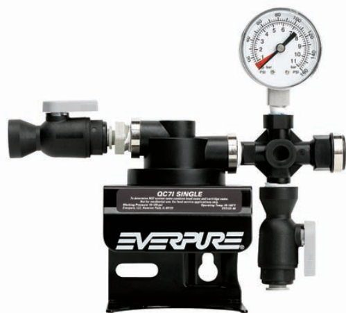
QC7I Single Head: EV9272-41

Filter head exclusively for Everpure replacement cartridges