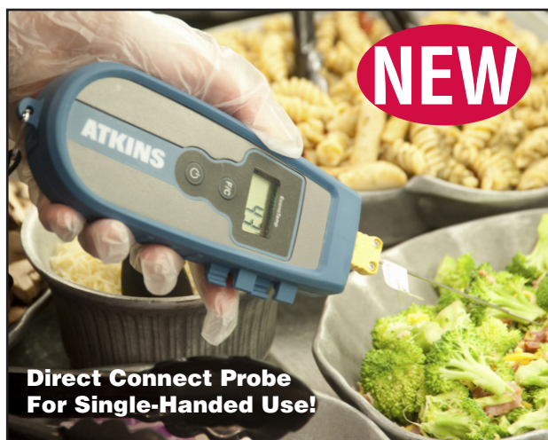
50337-K Direct Connect DuraNeedle Probe