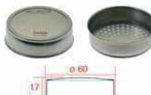
E61 200 IM