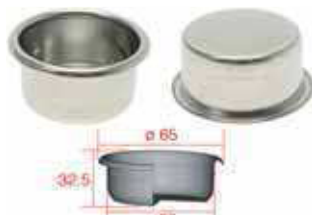
B65 2T M32 M