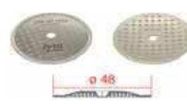
SM 35 WM