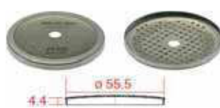
MA 35 WM