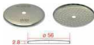
RA 200 IM