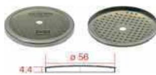
RA 35 WM