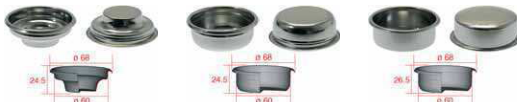
B68 1T H 24.5 E