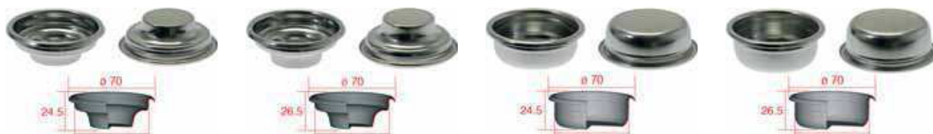
B70 1T H24.5 N