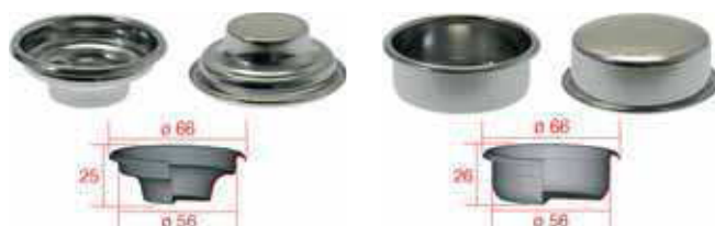
B66 1T H25 M