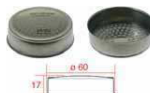
E61 35 WM