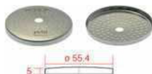
MA 200 IM