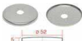
SP 200 IM