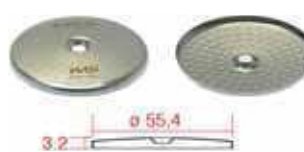
SI 200 IM