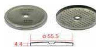
SI 35 WM