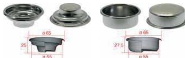
B65 1T H25 E