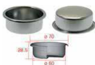
B70 2T H28.5 E