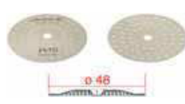
SM 200 IM