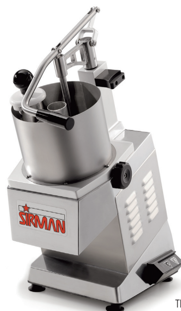
TM - TG