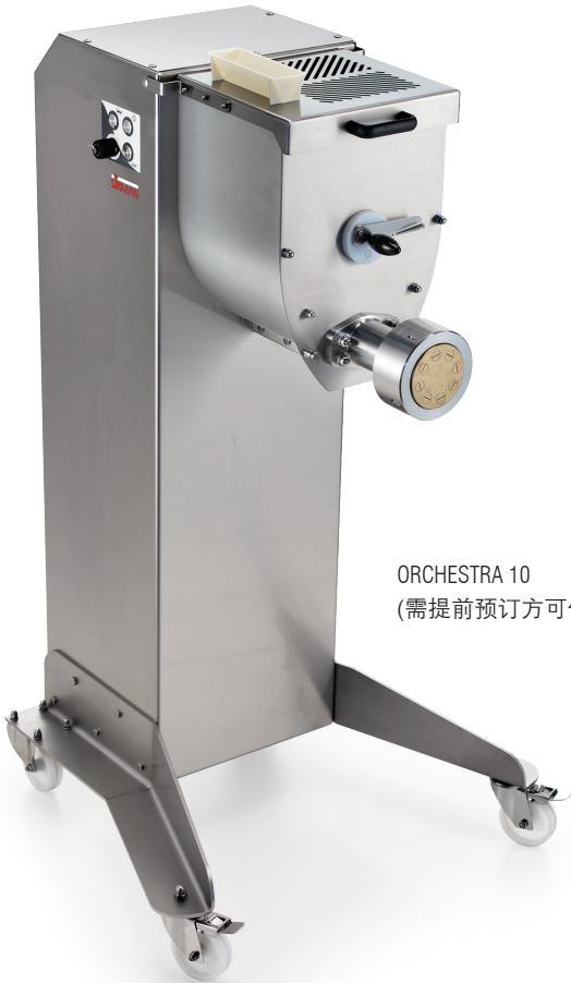
ORCHESTRA 10 (需提前预订方可供货)