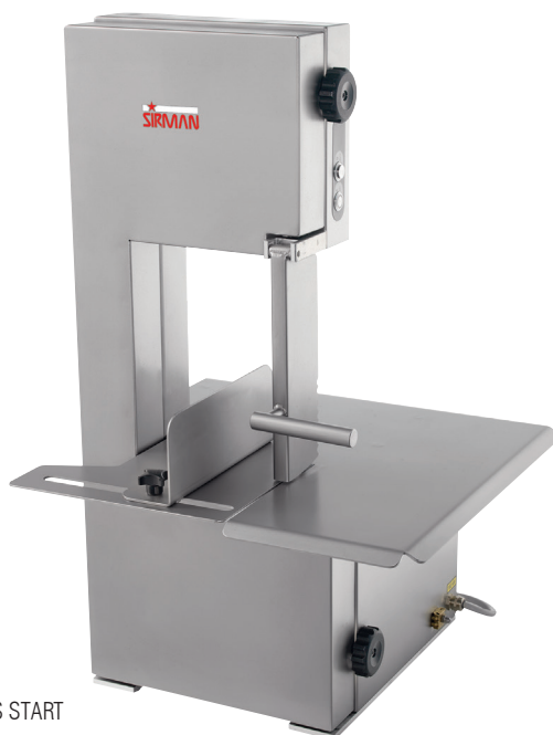
SO 1650 S.S START

性价比高 与 SO 1650 S.S所用材质、功率、特征等完全一致，主要区别在于废料收集槽内，门是一体式的；降低了生产成本，但又没有改变产品品质；