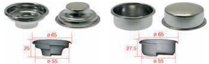
B65 1T H25 E

• Spaziale - Astoria Plus 4 you - Wega Concept