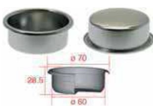
B70 2T H28.5 E