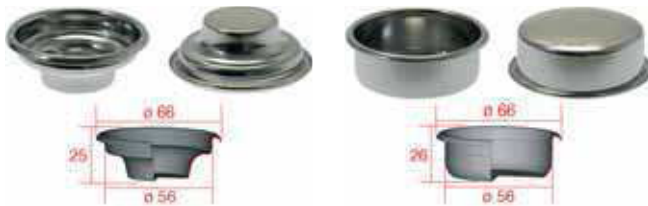
B66 1T H25 M