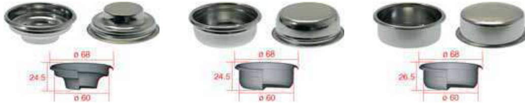
B68 1T H 24.5 E