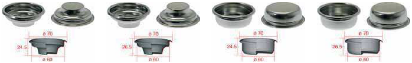
B70 1T H24.5 N

• Astoria - Casadio - Conti - Elektra - Fracino - Magister - Marzocco - Nuova Simonelli - Pavoni - Promac - Rancilio - Victoria Arduino - and for E61 groups type